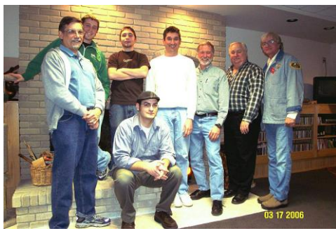
Stop at Lou's Design and Lab shop