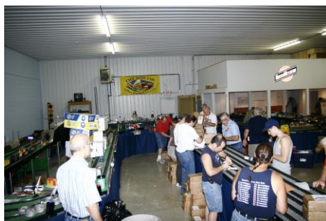
More cars being processed for shipment