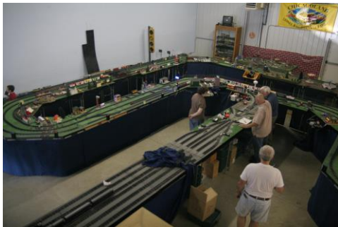
Our building and layout in June 2006