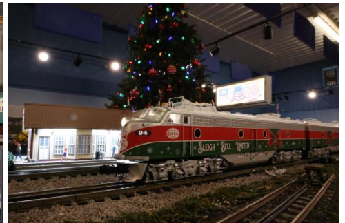
Christmas Season with Christmas Trains