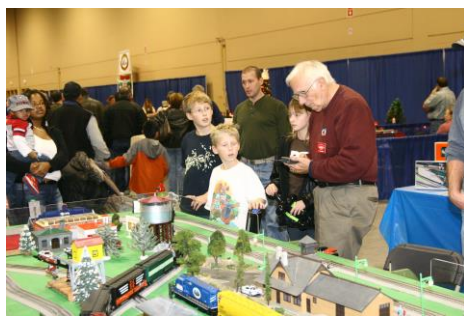
Al sharing TMCC control with visitors