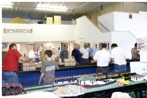
Members ready cars for shipment

We placed a big order with Lionel for our Great Northern Work Train. This was the first time we ordered four club cars at one time. It consisted of the Bunk Car, Tool Car, Welding Car, and a CLRC Drag Racing Team Bunk Car. Our members shipped them on August 25, 2006. One can see these cars in our CLRC Trophy Club Car case.