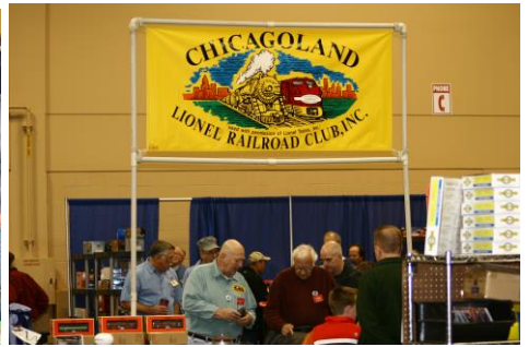
Members manning CLRC Layout