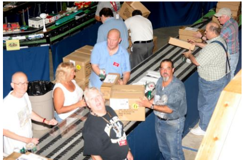
Members pack Western Pacific Boxcars