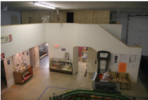
Look closely and see Santa's workshop (now the Back Shop)