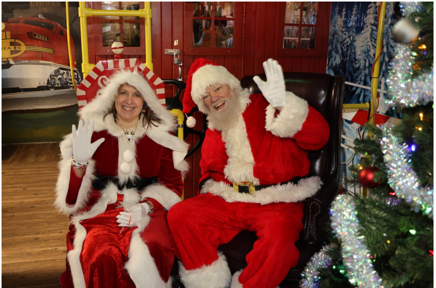
...And Santa with Mrs. Claus

Club Phone Line 815-485-2588 • Visit us on the Internet: www.clrctrains.com