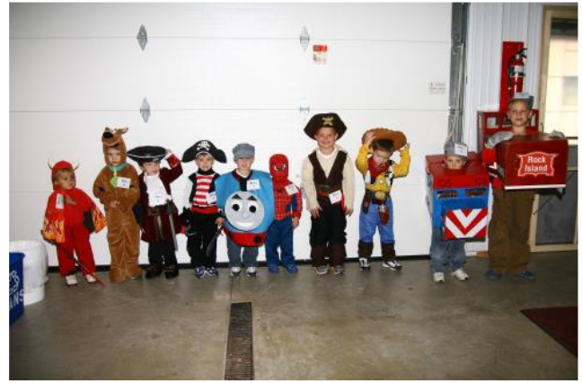
Many of the contestants in costume