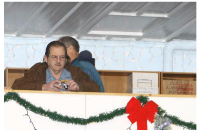
Thanks to Herb K. for the story and pictures