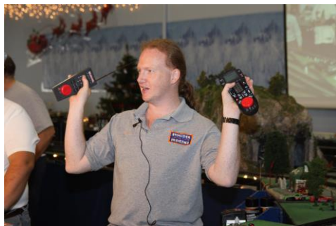
Lionel's Rich Presents Legacy System