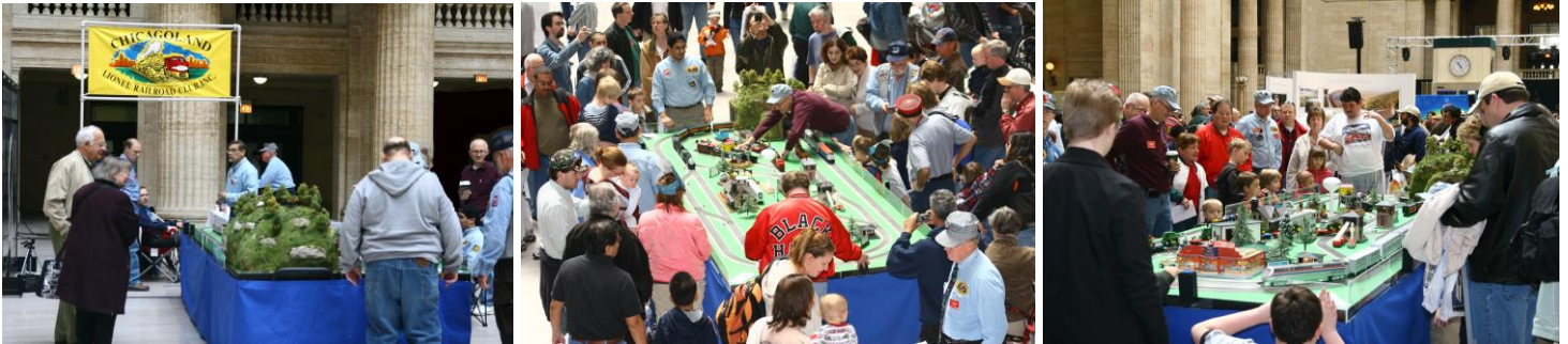
Setting up the trains and drawing a big crowd at Amtrak's Train Day at Chicago's Central Station

Amtrak was holding its annual Train Day at Chicago's Central Station. We participated with our small traveling layout (before it became the Isle of Sodor, Thomas the Tank, layout). Moving layouts has become a lot of work. The layouts seem to get heavier the older we get. Go figure! Despite that, we enjoyed participating. We also were a big attraction as you can see from the crowd around us.