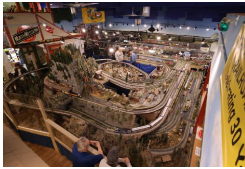
January's layout, we have come a long way since 2008