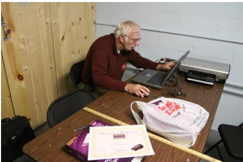
Al printing out Certificates